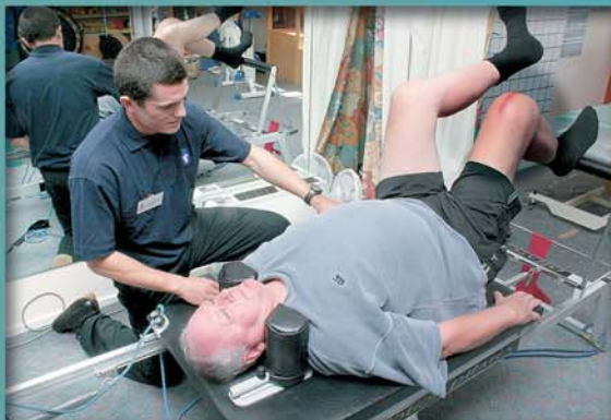
Becoming active after surgery

Māte romiromi koe e āwhina kia kori tinana HAUMARU koe.